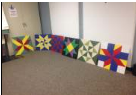
Some real beauties here!