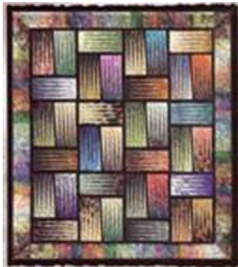
Stepping Stones (Judy Niemeyer pattern)

Time: 9am—3:30pm Place: Apache Middle School Cost: -$30 for class -plus cost of pattern (as much as $18) -$10 if you want lunch from Schlotsky's