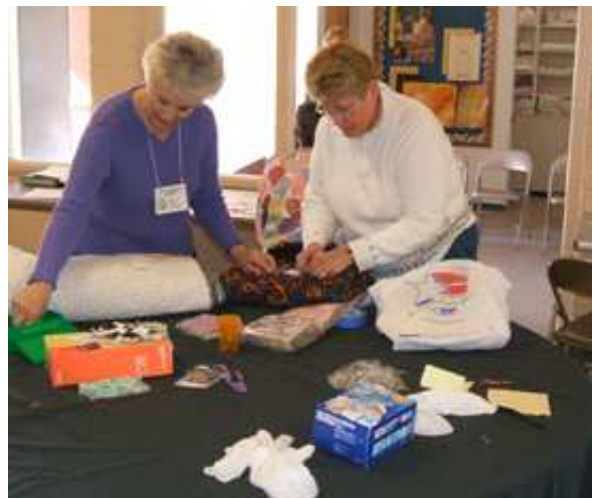
Preparing for Quilts Galore!