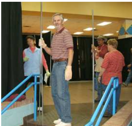
Preparing for Quilts Galore!